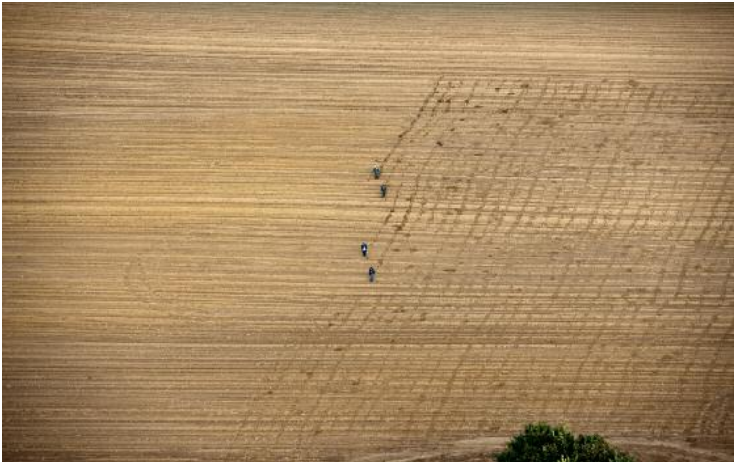
Below: Men detect a field at Rendlesham in August 2012, leaving tracks and pits in the ploughsoil