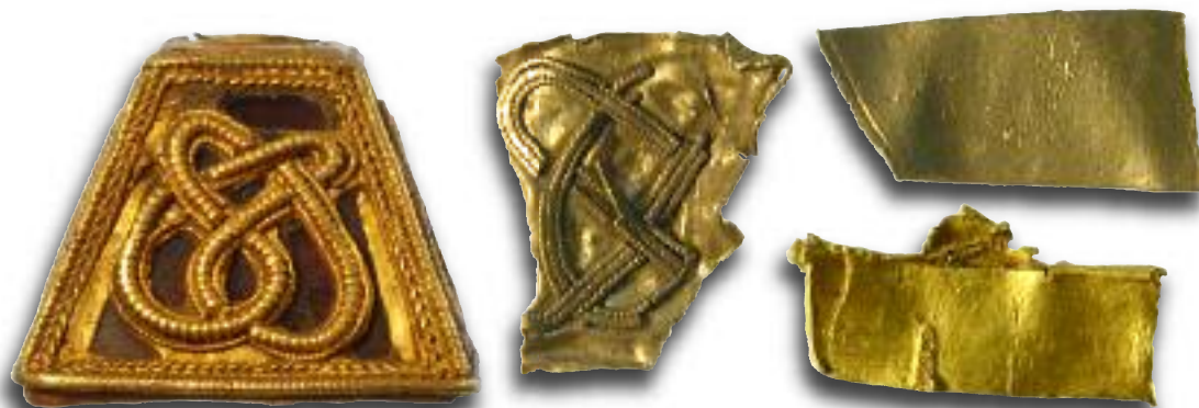
Below: Gold and garnet sword-handle fitting (width at base 21mm), and cut fragments suggesting a goldsmith's workshop (to scale, decorated piece 12mm long)

Our evidence shows that the seventh century settlement at Rendlesham was particularly rich and extensive. We believe that it was an important central