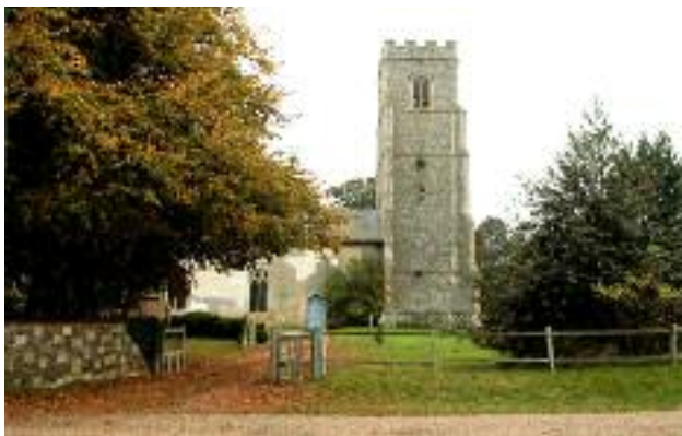
Below: St Gregory's church, Rendlesham