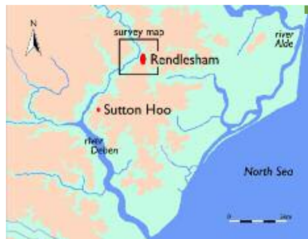
Above: Rendlesham is in the Deben valley upriver from Sutton Hoo

The Archaeological Service looked for objects in the ploughsoil with systematic metal-detecting, and for deeper intact evidence with magnetometry. They also reviewed