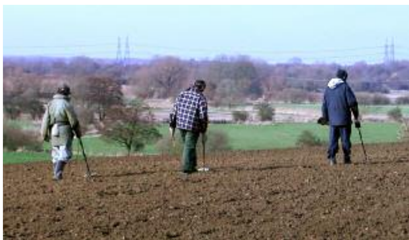
Left: Metal detecting, looking across the Deben valley

features. Mostly they recovered broken fragments discarded as rubbish – just as much a part of the story as rarer finds such as coins.