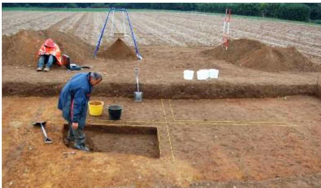
Above: Roy Damant excavating an Anglo-Saxon sunken hut in 2013