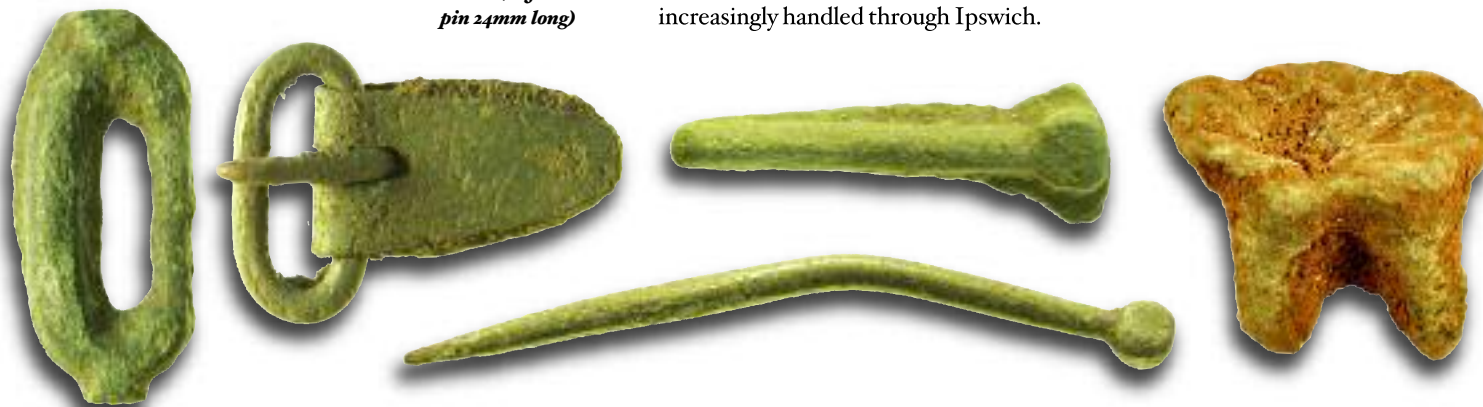
Below: Unfinished copper-alloy Anglo-Saxon buckle and pin with finished examples beside and below, with a piece of bronze working debris (unfinished pin 24mm long)

Saxon England before then. Instead, gold and silver valued by weight were used as currency, and gold coins from the continent acquired as raw material for smiths and for their bullion value. The first Anglo-Saxon coins were gold shillings. Towards the end of the seventh century these were replaced by silver pennies (also known as sceattas). Minted in England and on the continent, these were an international trading currency.